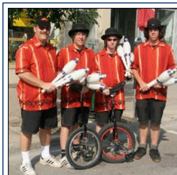
enlarge... The 29th annual Spring Juggle-In runs Friday through Sunday at Rochester Institute of Technology's Clark Gymnasium in Henrietta. Day in Photos